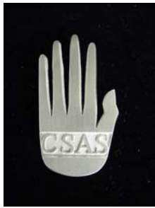
"logo" pin antique finish