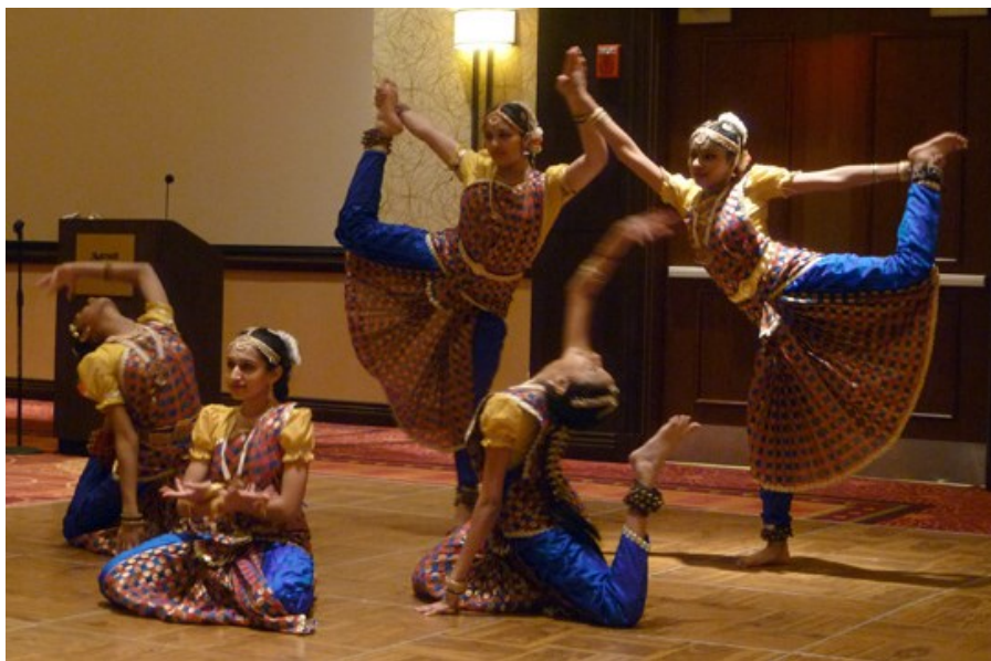
Indian Dance Troupe, CSAS 2014