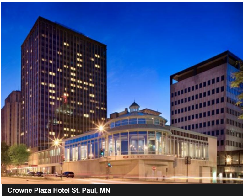
Crowne Plaza Hotel St. Paul, MN