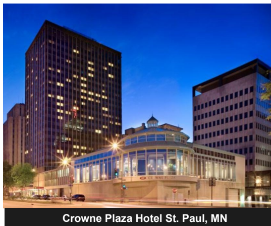
Crowne Plaza Hotel St. Paul, MN