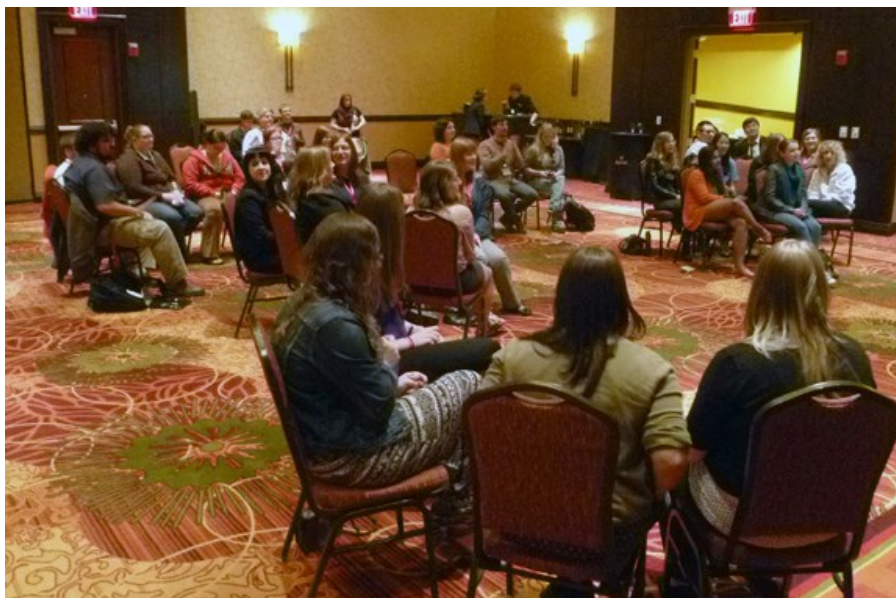
Student Session, CSAS 2014