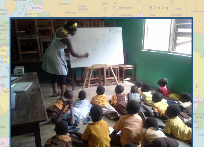
Aminata teaching kindergarteners in Ghana, yes we were in the storage closet

I love being an anthropologist, but it requires a lot of flexibility and adjustment of my family. Both my boys are with grandma [oma] in the Netherlands right now and are becoming quite fluent in Dutch as they attend Dutch public schools. Being without mom for months at a time is not always easy however, but thanks to skype, phones, and lots of support from aunties and uncles we are making it work.