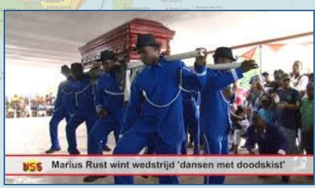
Drageman winners of the contest - Suriname https://youtu.be/E-6b3cZaflo