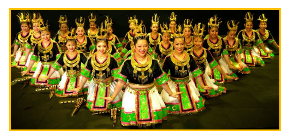
Iny Asian Dance Theater (http://ww2.inyasiandancetheater.org)

The cultural event was a Hmong fashion show and dance program by the Iny Asian Dance Theater. The high-light of this was having the opportunity to learn the traditional Hmong dance moves. We have some talented dancers in our group!