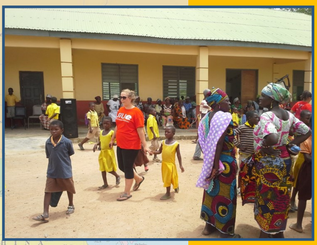
Community day at our after school program in Kaluri Ghana